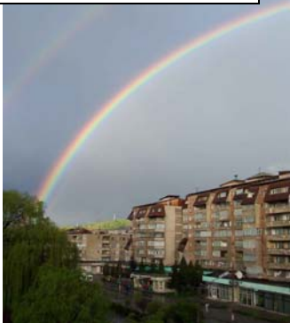
Rainbow over Lupeni- Beauty and the Blocks

The combination of great joy amidst pain characterizes so much of our experience in Lupeni. In almost everything, the fullness of God's love and beauty seems so apparent; however, nothing feels free of the world's brokenness, and sin. One of the most poignant examples of this was hosting 38 kids with HIV/ AIDS for the final week of the Viata Program. The kids came to us more physically ill and more emotionally scarred than we anticipated. Many of our campers were between hospital stays; most required frequent rest. They shared with us their stories of kids taunting them, of doctors refusing to treat them, and of parents' expressing